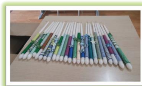
Easter candles made by the children of Larnaca Toy-Library

The “Toy Libraries” is one of the 5 programs of the Youth Infrastructure Projects Sector. They are organized places with toys, where children 4-12 years old and children / adolescents with special needs can play, individually or in groups, with the participation of specialists, as well as their parents. Toy-Libraries are specially designed and organized facilities, equipped with carefully selected, high quality toys. The children have the opportunity to develop basic knowledge and psychomotor skills and to socialize through playing with children from different socioeconomic backgrounds and origins, along with children with special needs.