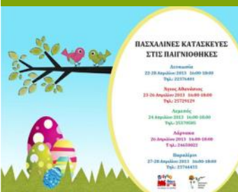
Invitation for the Easter events of all Toy-Libraries