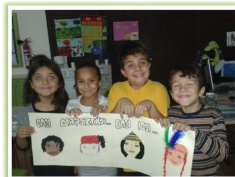
Anti-racism poster of Paralimni Toy-Library “All different-all equal”

Our Toy Libraries operate daily, including weekends, throughout the year, except for public holidays and August. The entrance is free and the operating hours are between 15:30 – 18:30 (between October and April) and 16:00 – 19:00 (between May and September).