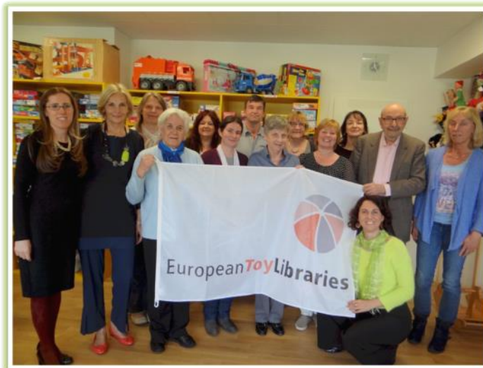
ETL Meeting in Geneva

15 participants from 10 countries were present in Geneva. The meeting was again very motivating and once more, the participants informed about the work in their countries. These reports are always a very important part of the meeting. The exchange of experiences is very much appreciated and gives new ideas and also helps us to understand each other better and this is a primary purpose of any international organization.