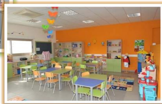
Agios Athanasios Toy-Library