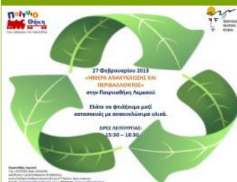
Invitation for a recycling campaign in Limassol Toy-Library