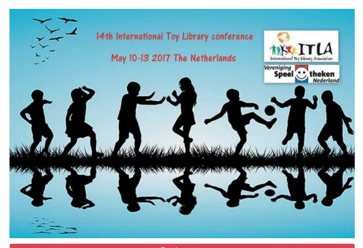
Back to top

centre is easily accessible by public transport and by car.