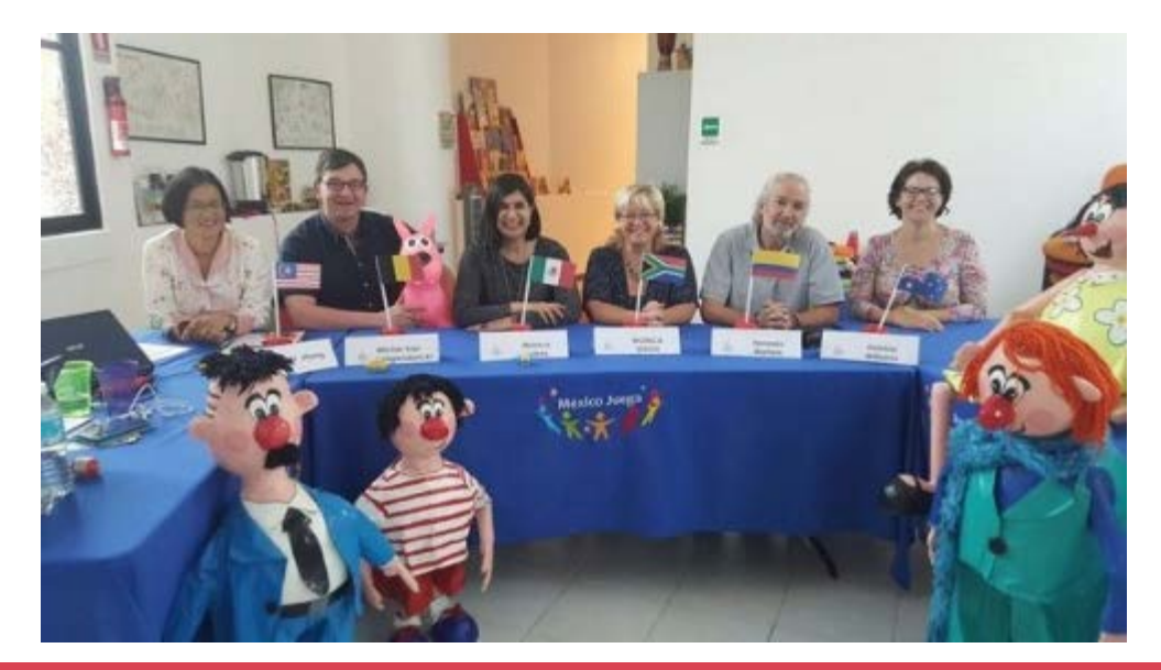
Back to top