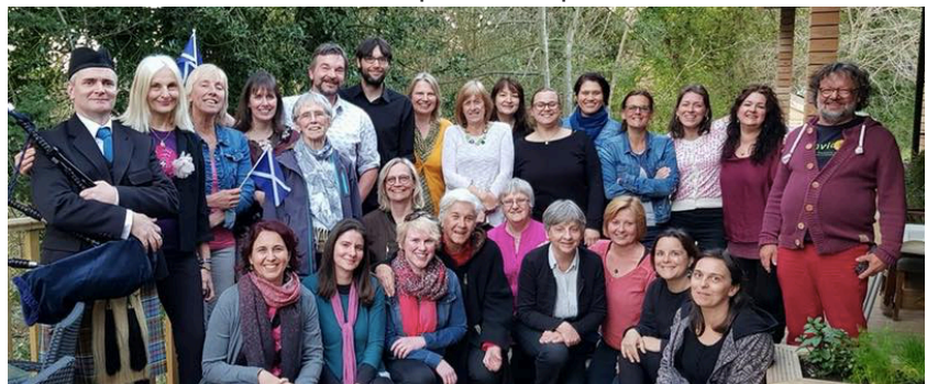
The 22 nd Meeting of the European Toy Library Group April 20-April 21, 2018 Edinburgh - Scotland

Members from the following 12 countries attended the 22 nd Meeting of the European Group: Austria, Belgium, Denmark, France, England, Greece, Italy, The Netherlands, Portugal, Scotland, Switzerland and Tenerife