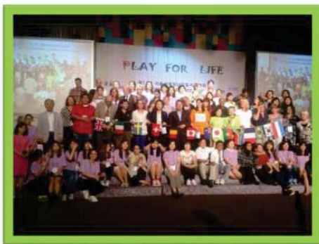
All the Toy Library Friends

As the host of the 13th International Conference of Toy Libraries, we expected that the conference could be a good chance to promote the value and the importance of play for good life as well as a helpful floor to share information about toy libraries with other countries. During the conference, we could see and hear how Toy Libraries in other countries are run, what kind of vision they have, and also what kind of challenges they are facing. And we could understand one another more deeply and share valuable information and experience with people working for Toy Libraries and children. We could see that we have reaped the fruit expected from the conference since we have had feedback on the conference from many participants saying that they could make their belief in the role of