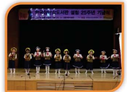
1 st Asian Toy Library Conference

We are looking forward to the 5 th ATLC which will be held in Taiwan in June 2016.