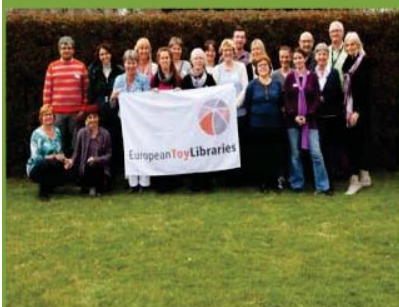
The Group of European Toy Libraries - ETL