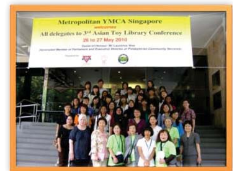
3rd Asian Toy Library Conference

In the East where academic excellence is emphasized, play is often an educational tool for learning rather than a simple activity of pleasure. Due to our competitive educational system, teachers and students focus on educational excellence and scoring A's in our school examinations.