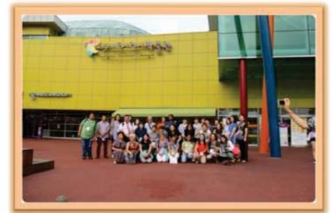
Kyunggi Children's Museum run by Kyunggi Province Government

In the morning of the last day, the new board members of ITLA were introduced, and the next host country was announced. After the closing ceremony, 25 foreign participants visited a Toy Library run by the Guro-District which is quite spacious and well organized. They could see the framework and the role of the toy library for both children and all the people in a community. Guro-District was the district where the very first Toy Library was founded in Korea and has had a deep interest in the toy library movement and child caring, and sponsored KTLA for the Conference. After visiting the toy library, some foreign participants joined the Guro Children Play Festival, and they enjoyed the festival playing various games with children.