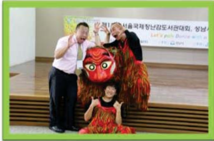
Preparing the art performances

With the theme of “Play for Life”, the 13th International Conference of Toy Libraries was held in Seoul, Korea from August 18 to 22. From 24 countries, about 200 people who are engaged and interested in Toy Libraries, Early Childhood Education and Care, or Children’s Play participated in the conference. The history of Toy Libraries and the various contexts where Toy Libraries had contributed to children’s development and whole family happiness in some countries were introduced. Also, the policies and the vision for Toy Libraries, and the diverse kinds of play and games of past, present, and future were shared.